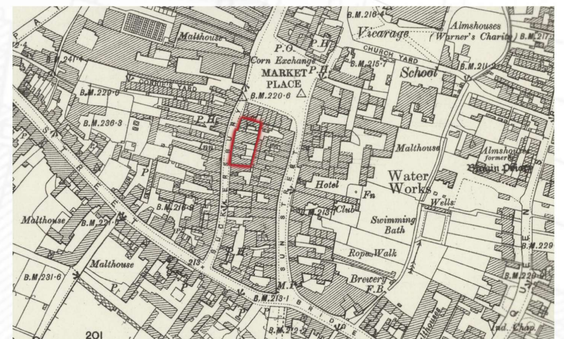
Historical Map of Bucklersbury, Hitchin